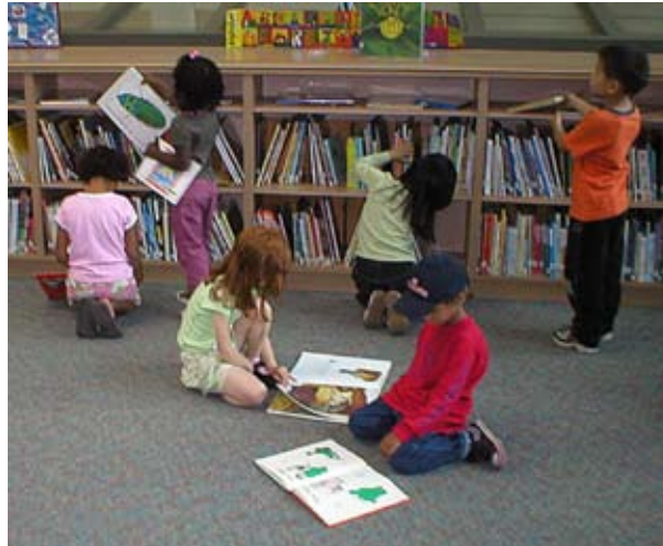
Kindergarten students enjoy selecting books during their first library visit.

This is the time of year to ease into school routines, and for “snuggling” into a year of learning new skills and exploring new ideas. The district has made this process easier with a great website, www.library.seattleschools.org . Each year the “Online Student Resources” page adds valuable information. For example you can now link directly to the Source where you can keep up with your student’s progress. One can also access our library’s book catalog as well as SPL’s catalog. My favorite link is the TumbleBook eLibrary. You can listen to and read along to many favorite books. For general research the World Book Encyclopedia and CultureGrams are excellent resources. If accessing these links away from school, the username is W001CSEATL and the password is WELCOME. Another excellent web site out there is www.refdesk.com , which bills itself as “the single best source for facts.” It is easy to use and seems to have everything one would need to aid in general reference.